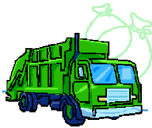
Rubbish is collected from your house