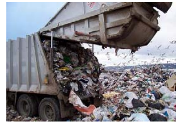
Materials which can't be recycled are taken to a landfill site