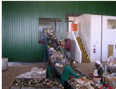
It is taken to the Materials Recycling Facility (MRF) where people take out any materials which can be recycled