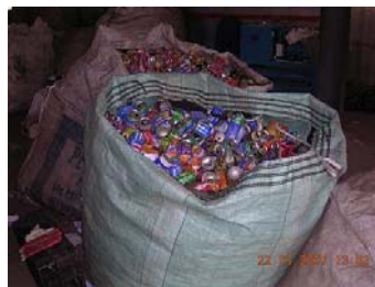
Recyclable materials are collected and made into new materials