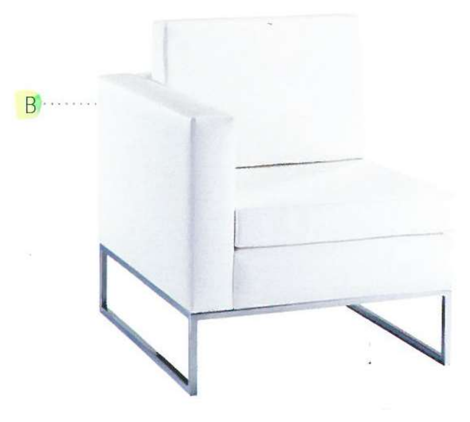
Page 31 of 35