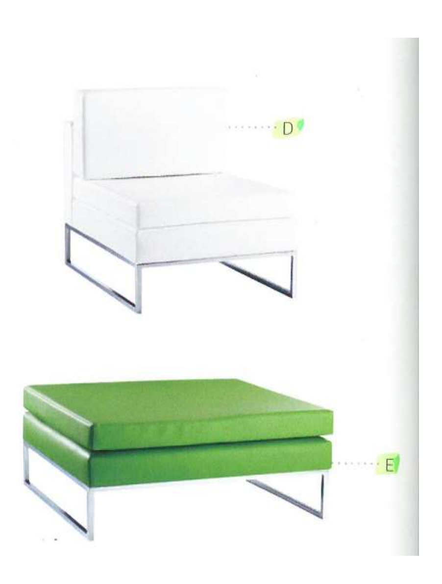
Page 30 of 35