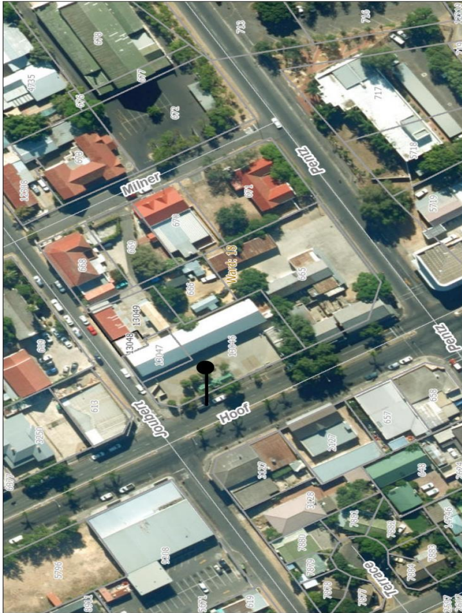
Drakenstein Web Map

1:1 128 0 0.0075 0.015 0.03 mi 0 0.015 0.03 0.06 Km