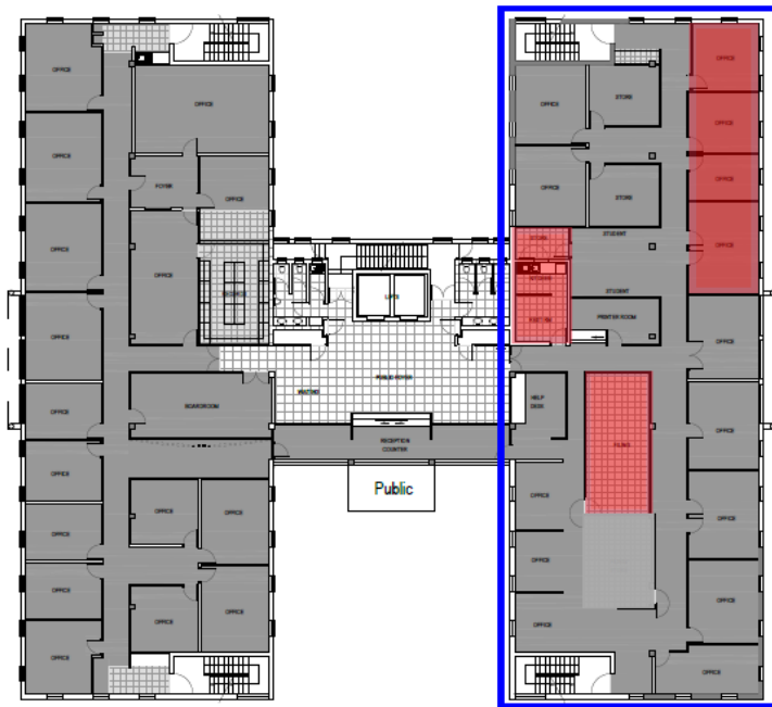
THIRD FLOOR PLAN scale 1:100