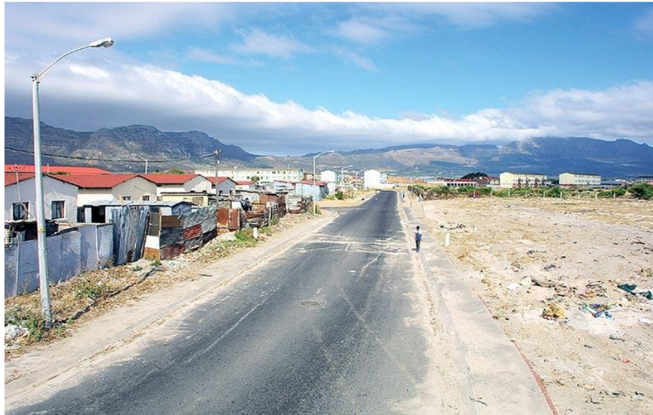
Level 3 Unacceptable standard of cleanliness