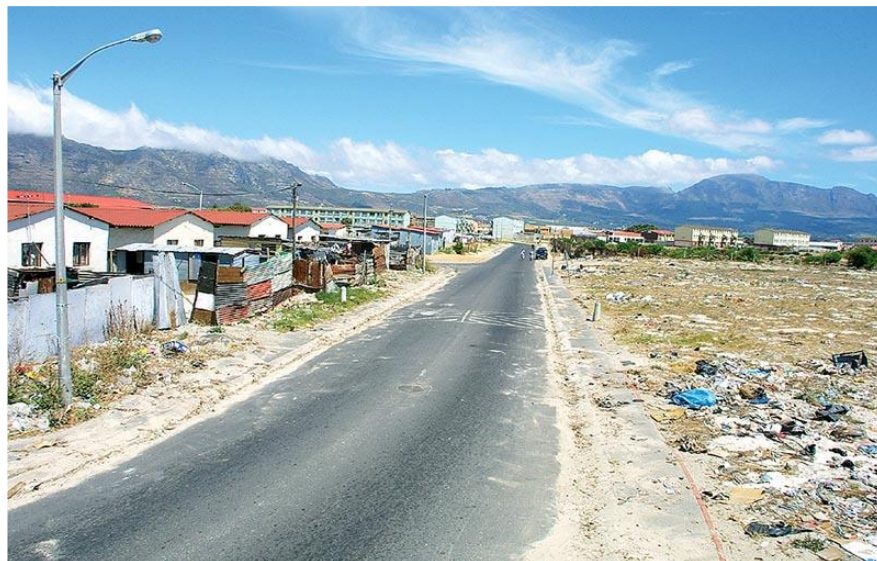
Level 4 Totally unacceptable standard of cleanliness