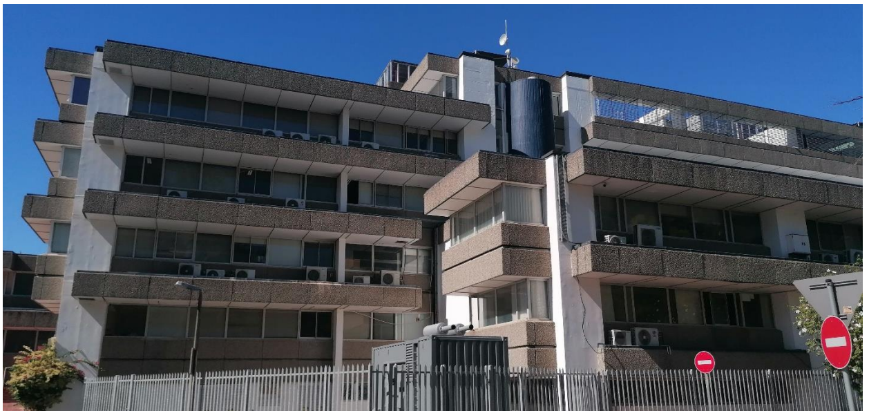
Figure 2 - View of generator near building