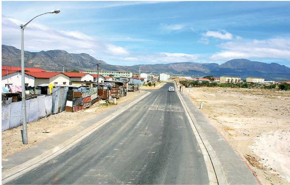
Level 1 Desired standard of cleanliness