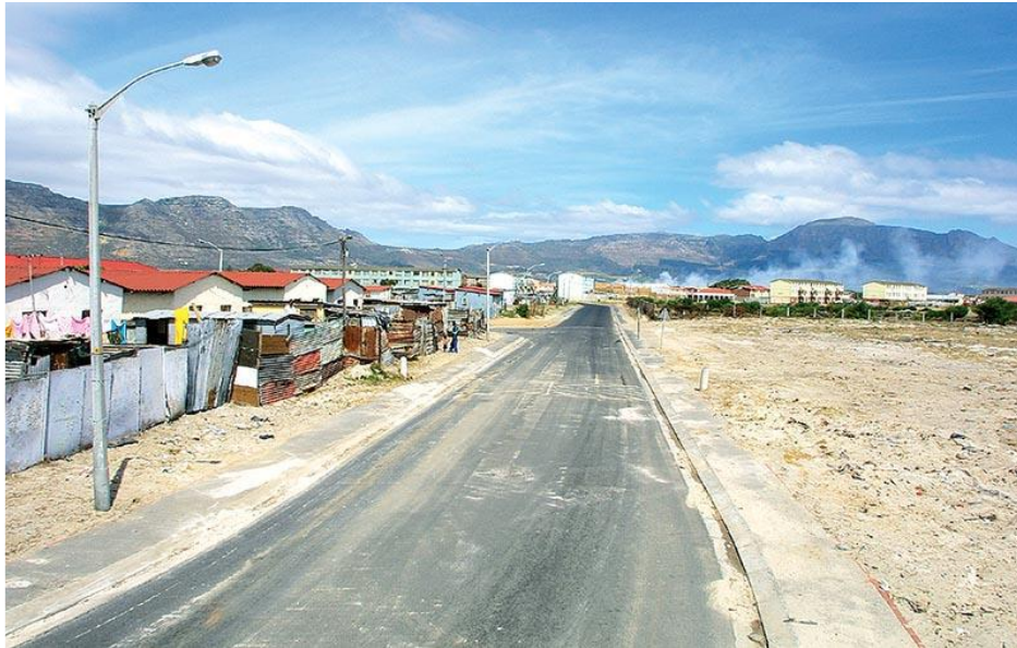
Level 2 Fair / reasonable standard of cleanliness