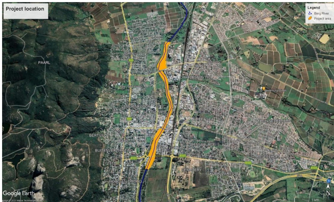
Figure 1: Location of project area.